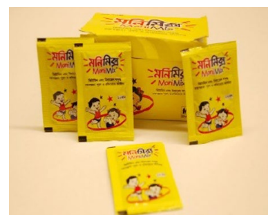
Figure 2: Micronutrient powders sold by SMC's community health workers