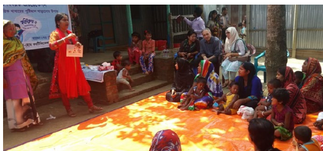
Figure 3: BRAC community health workers engaging with mothers about the micronutrient powders

The Maternal, Infant and Young Child Nutrition (MIYCN) Home Fortification Programme was implemented in 164 Upazilas (sub-districts) & 6 urban slums in Bangladesh (area coverage 33.3%) during July 2013–April 2018. The programme provided age-appropriate counselling on Infant and Young Child Feeding (IYCF) and home fortification to improve micronutrient intakes of 6–59 months of aged children in the rural and urban slum communities of the selected areas. BRAC’s community health workers visited the households of the targeted children to provide this intervention and sell micronutrients. 5 The total number of children aged 6–59 months reached was 5,358,604 for the full programme period by BRAC and SMC.