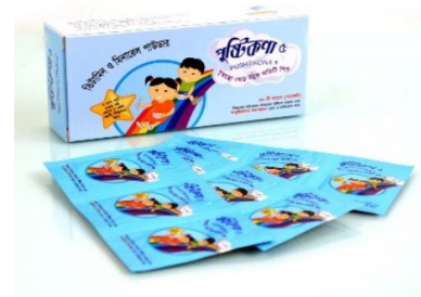
Figure 1: Micronutrient powders sold by BRAC's community health workers

The provision of free MNPs through the health system is not necessarily sustainable. The question was, can MNPs be sold at an affordable price such that they have a significant impact on under 2 anaemia? If this is possible, what is the cost-effectiveness of doing so? GAIN, BRAC, SMC, Renata, a Bangladeshi pharmaceuticals company, icddr, and the Children's Investment Fund Foundation (CIFF), set out to evaluate whether such a programme could reach those who are vulnerable, whether they were impactful and whether they were good value for money compared to other routes to improved nutrition outcomes.