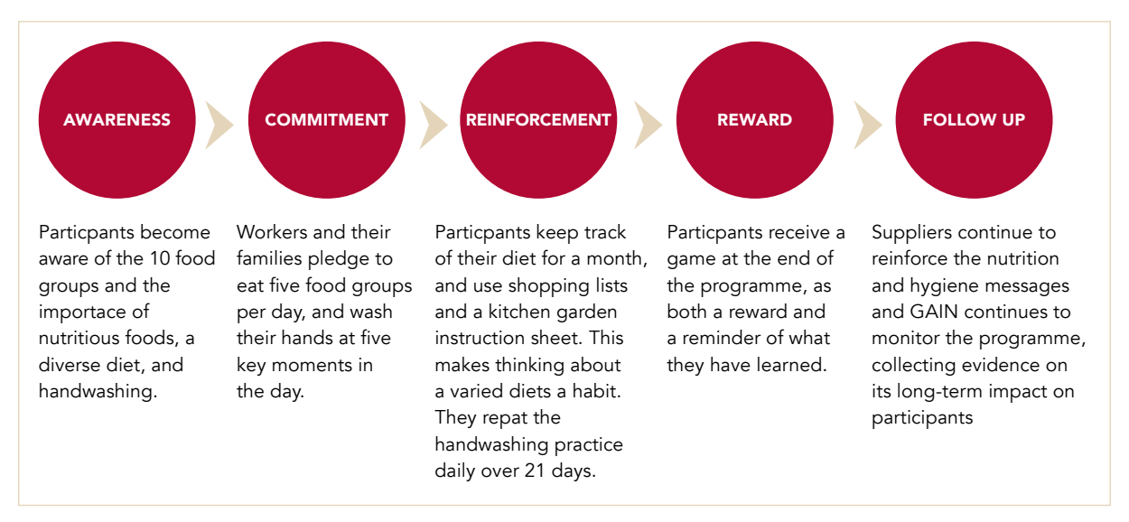
Figure 2: The Seeds of Prosperity Intervention