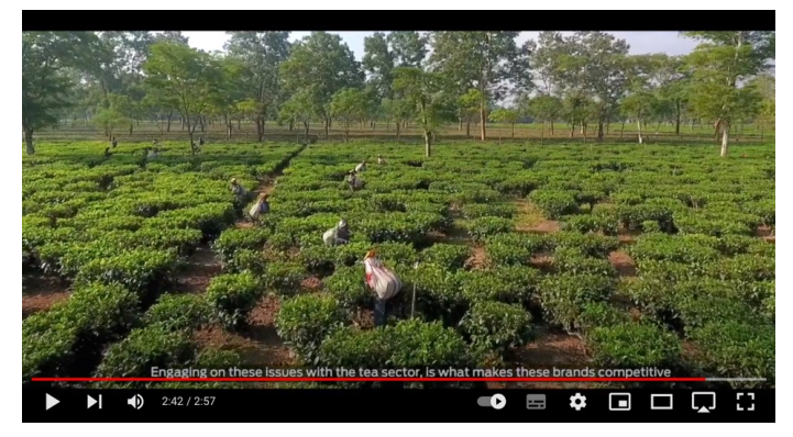
Figure 1: Video Showing the Assam Seeds of Prosperity Programme

A successful pilot programme in tea estates and factories in Assam and Tamil Nadu, India would increase the number of food groups that supply chain workers are eating, with the aim of improving both their intake of essential