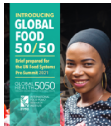
Figure 4: The Global Food 50/50 scorecard

Global Food 50/50: The key role that women play in food systems and food businesses—growing, processing, purchasing and preparing food—is well known and yet too many organisations neglect women in their own decision-making processes or in their programme and policy work. GAIN has been a big supporter of Global Health 50/50, a gender accountability process promoting gender equality in health system organisations and we saw an opportunity to do the same in food systems. We played a key catalytic connector role and IFPRI together with Global Health 50/50 did the rest: the Global Food 50/50 was born.