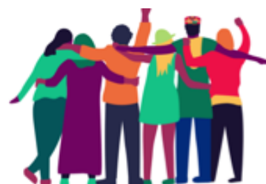
Figure 3: Act4Food Act4Change Youth Campaign to “Fix our broken food systems” – 160,000 pledges have been received, as of May 2022.

Act4Food Act4Change: Is a youth led campaign which now has over 160,000 signatures from around the world and was supported by GAIN and the Food Foundation. It raises awareness of food system issues among youth. The campaign is pushing for youth representation in food system decision making fora, including at GAIN. The campaign is not just about awareness and representation, it is about making decision makers in public and private sectors aware of the priorities of youth, challenging them to do something about them. Finally, it is sharing information about what the youth themselves can do to change food systems, without waiting for permission.