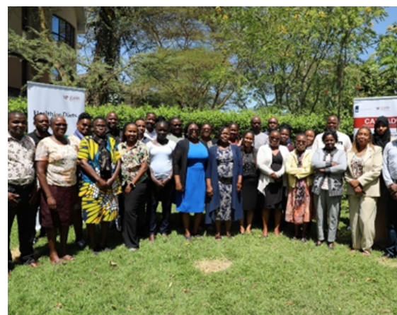
Group photo of the flour blending initiative team taken on 8th March 2024

GAIN is supporting a multistakeholder effort led by the Ministry of Agriculture and Livestock Development (MoALD) to develop the Flour Blending Social and Behaviour Change Communication (SBCC) strategy which aims to contribute towards food security, improve nutrition and increase employment opportunities in Kenya. The SBCC strategy outlines coordinated activities to engage key stakeholders to influence positive change in the production of underutilised crops such as cassava, millet, sorghum, and sweet potato for flour blending and increased production and consumption of blended flour products. By reducing the pressure on maize as the main staple food, the multi sectoral approach targets a high impact approach in securing a diversified food basket.