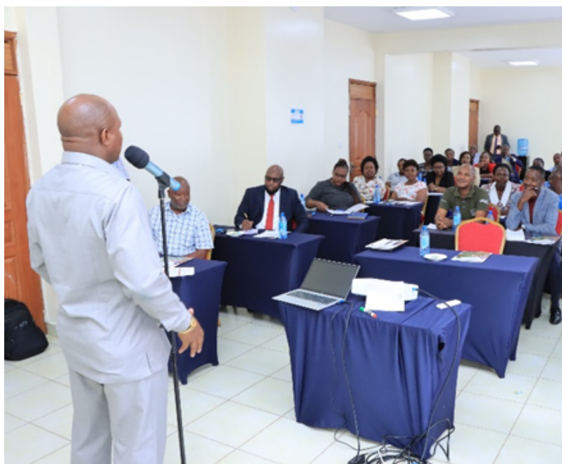
Machakos County Deputy Governor addressing agricultural officer during a two-day workshop to train county agricultural officers on food safety

The standard is founded on four main pillars: food safety; environmental sustainability; plant health; and worker health, safety, and social accountability. The agricultural officers are expected to cascade the knowledge acquired from the two-day workshops to all producers within their respective counties for increased food safety. Implementation of this standard will boost the safety and quality of fruits and vegetables that are domestically produced and marketed in both formal and informal markets.